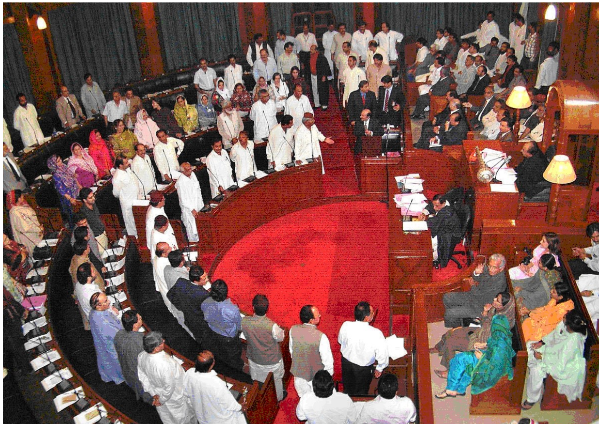
(Members in Sindh Assembly stand to show their support in favour of newly elected Sindh Chief Minister Syed Qaim Ali Shah on 8 th April, 2008.)