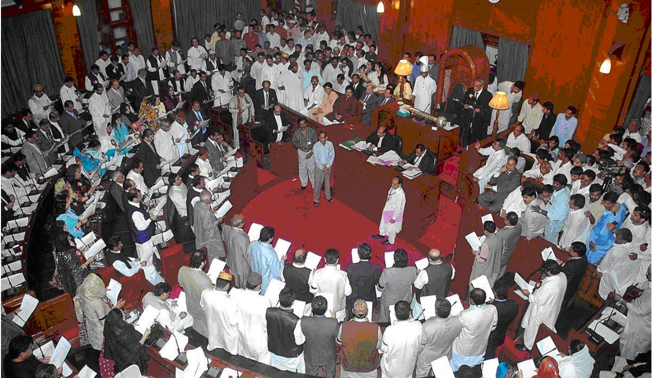
EVENT OF OATH TAKING OF NEWLY ELECTED MEMBERS, 05 th APRIL, 2008